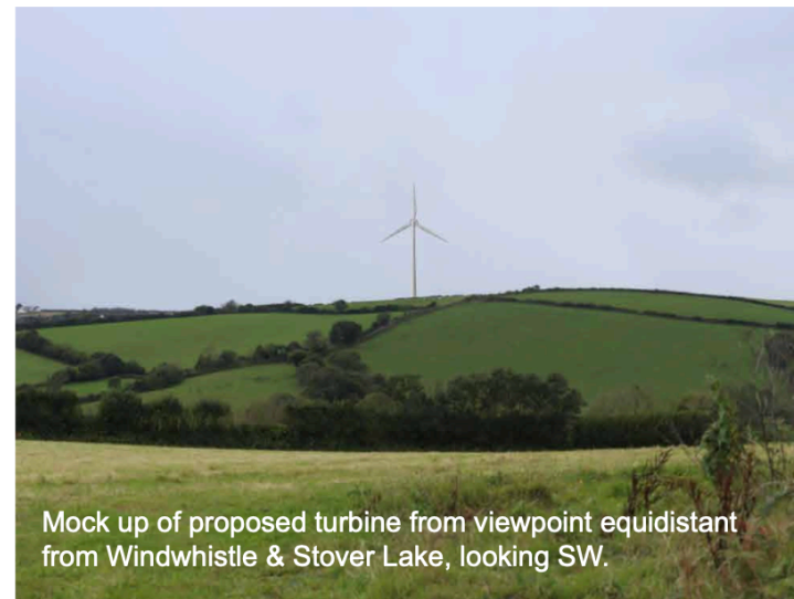
Mock up of proposed turbine from viewpoint equidistant from Windwhistle & Stover Lake, looking SW.